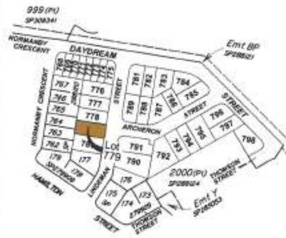
Locality Diagram Scale 1:4000